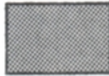
Dark Grey FS26173