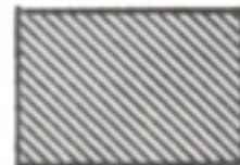
International Orange FS 12197