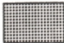
Gull Grey FS26440

Thanks to Jim Craig of the Army Aviation Museum at Ft. Rucker