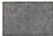
Dark Green FS24079